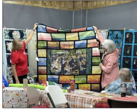
The Scrappers Quilt Guild in Ackerman have a great time showing off their creations.

One long-term community project for the Guild is the Sheriff's Quilts, where each member annually donates a lap-size quilt to the Oktibbeha